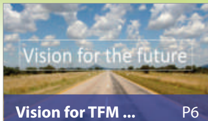
Vision for TFM ...