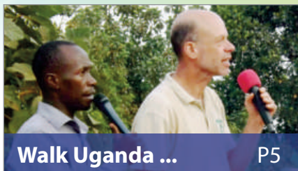
Walk Uganda ...