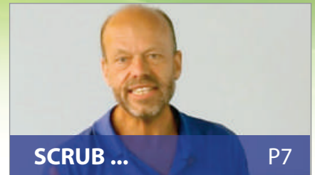
SCRUB ... P7