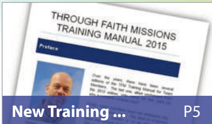
New Training ... P5