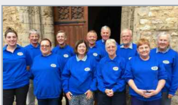
P5: Chatteris Mission