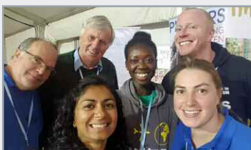
P4: UCCF forum